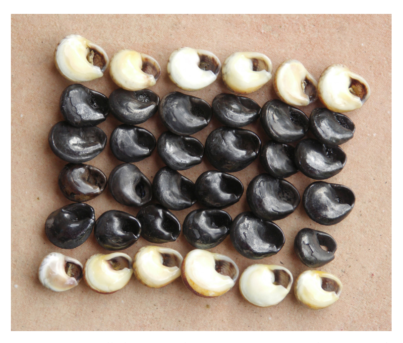
Figure 6. Experimentally heat-treated Tritia neritea compared to untreated ones.