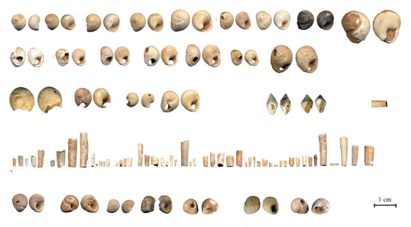
Figure 2. Representative sample of ornament assemblages from Early Paleolithic Phases 0–3.