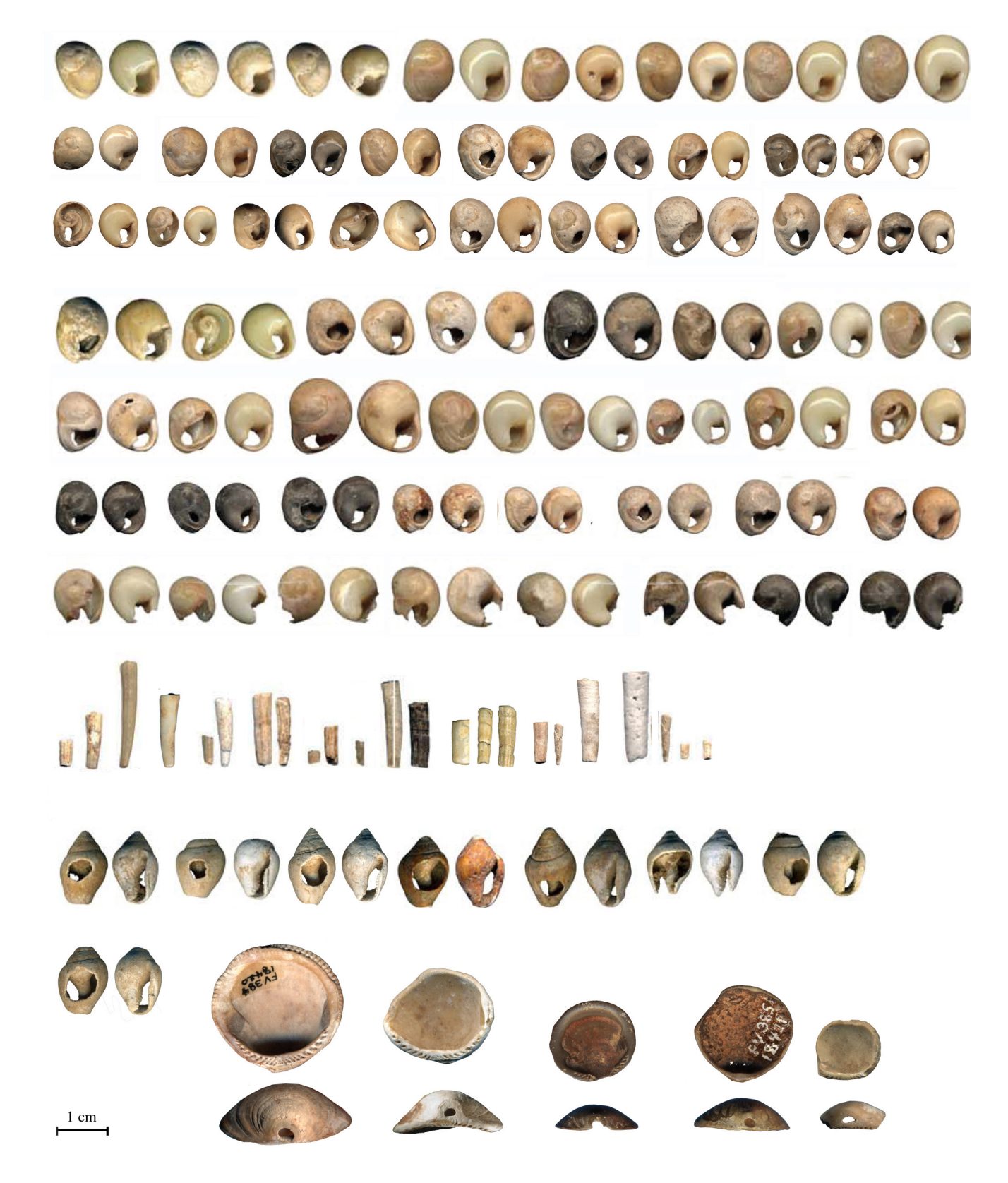
Figure 4. Representative sample of ornament assemblages from Late Paleolithic Phases 5 and 6. The status of the Glycymeris is uncertain.