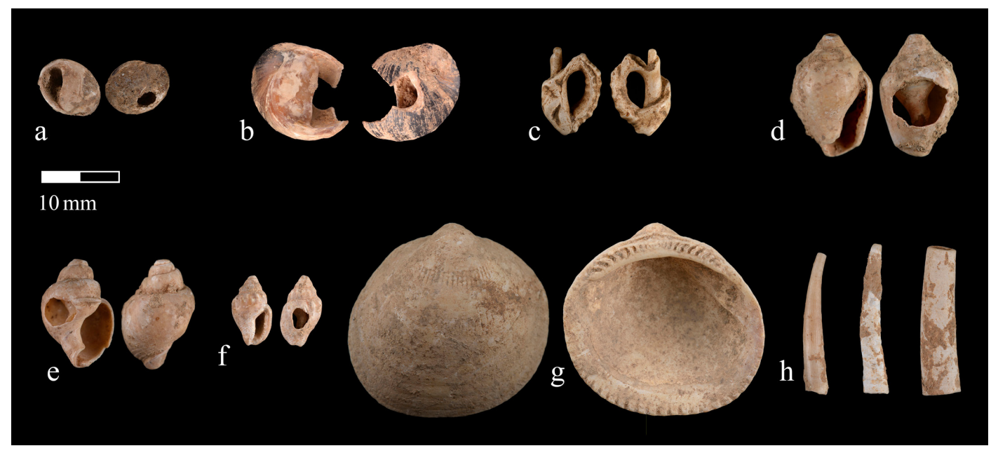
Figure 2. Selection of shells from Kebara Cave: a) Theodoxus michonii, b) Theodoxus chalucina, c) Ocinebrina edwardsii, d) Columbella rustica, e) Tritia mutabilis, f) Euplica festiva, g) Glycymeris nummaria, h) Antalis spp..