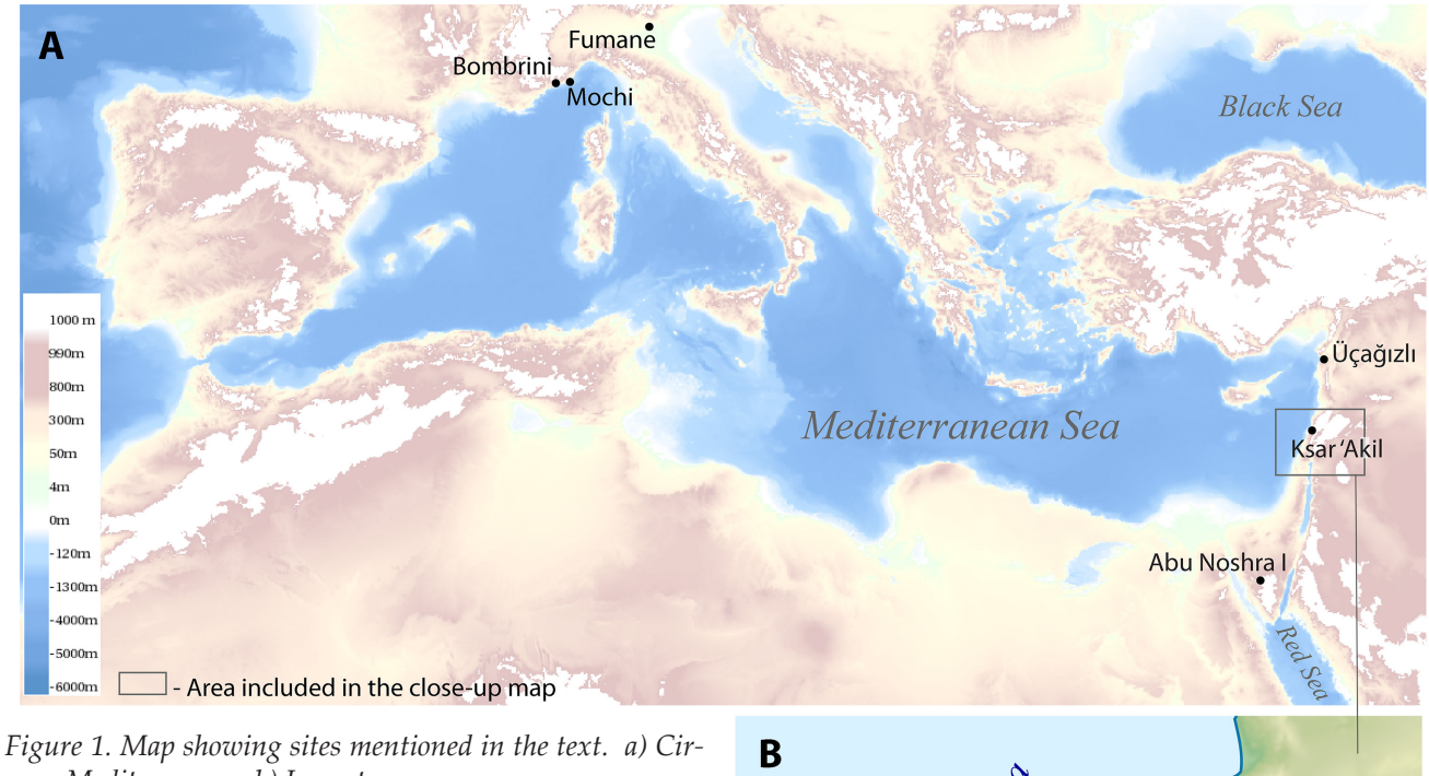
cum-Mediterranean; b) Levant.